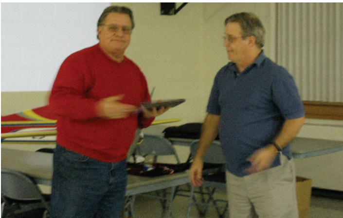
PHOTO GALLERY January Meeting