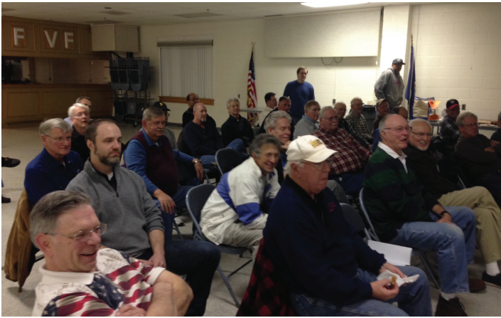
PHOTO GALLERY February Meeting