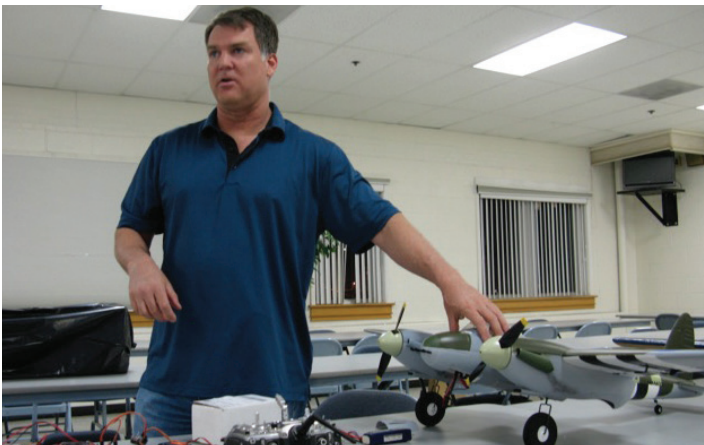
PHOTO GALLERY March Meeting and Auction

As spring arrives and you want to get out and fly take the time to do the following: Before packing up those planes make sure you preflight check your planes and equipment. Check all components thoroughly. One of the most important components to check are your batteries. If you didn't storage charge your batteries during the winter months then I would highly recommend running those batteries through a few cycles if your charger will support. I use the Hitec X4 Plus, 4 port, AC/DC Multi-Charger. This charger has a Cyclic Charging / Discharging feature that is perfect. However, if you believe those batteries are old or just not comfortable please just buy new ones. This will save your airframe and most importantly provide a safe environment for you and club members at the field. While that cowl is off it's also a good time to replace those CM6 plugs for those standard DLE and DA engines. Double check all tygon fuel lines and connections. Ensure that tygon pickup line in the fuel tank moves freely and haven't become stiff. There are other areas that should be checked as well but the above mentioned should get you started. Remember, It ain't fun if you ain't Low!