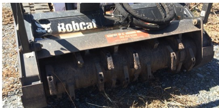
New weapon in the fight against the Autumn Olive

Multi-Rotor Flight Area - The newly-cleared acreage is a potential multi-rotor flight area that is not in conflict with fixed wing aircraft. However, the Board has chosen to discuss this in depth with the Multi-Rotor Committee because several factors are at play in setting up a MR flight area at Poplar Ford. For example, consider our neighbors. There is a riding stable east of our field and Manassas Battlefield to our south. We are on good terms with them because we take considerable care not to disturb horseback riders and we do not fly past Bull Run. These circumstances must not change. Another consideration is safety. Setting up a MR departure and landing zone near the spectator area is complicated by seasonal flooding. Placing that zone elsewhere would separate MR and fixed wing pilots. This would interfere with communications between the 2 groups. What protocols must be in place to safely retrieve a downed model from a MR flight area? If someone is injured, which group has the first aid kit? Who calls for help? These thoughts need to be addressed now rather than later.