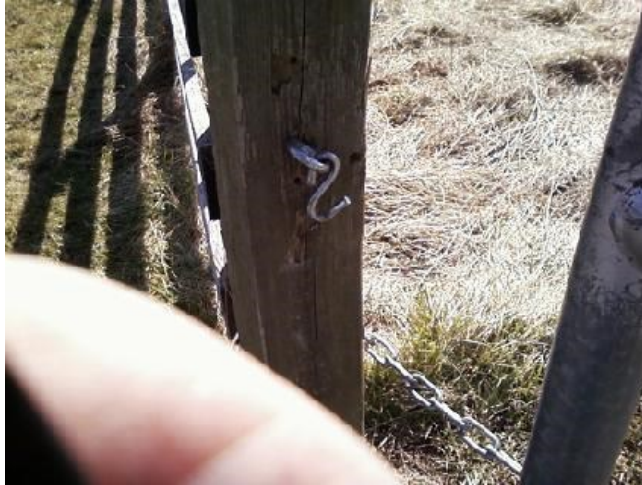
The busted “S” Hook

As discussed at the last meeting, there was an incident around February 6th where someone forced their way into Poplar Ford by forcing open an “S” link on the chain.