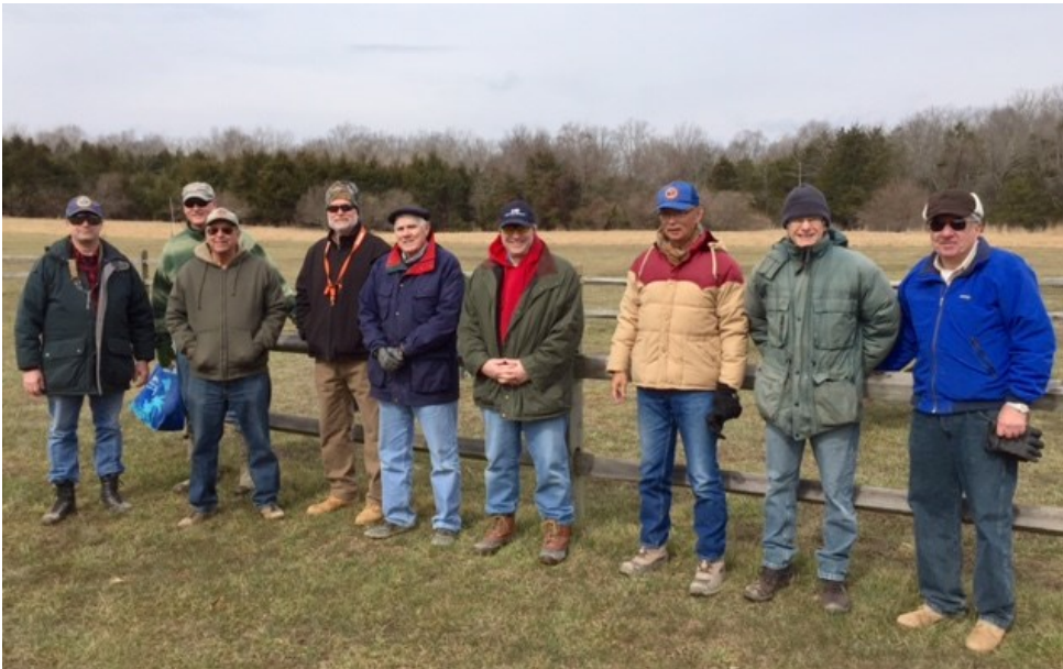
More mud than snow, but still a good turnout for the annual Snow Fly!

The annual Snow Fly was held back on March 5th. Although the pits were muddy it was a success and many members came out to celebrate the reopening of the field.