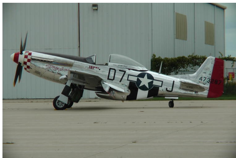
"Worry Bird", a P-51 from the 339th