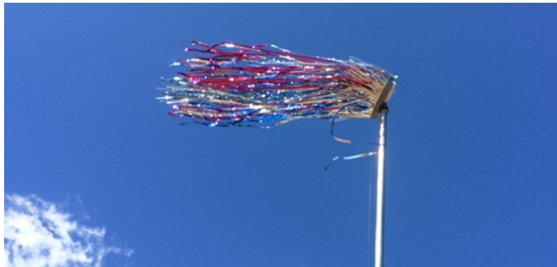
New Mylar Streamer

Duct Tape, The Universal Repair Tool -The field remained wet throughout March, necessitating use of waterproof boots by anyone attempting to enjoy the good flying weather we had. Both windsocks were in need of repair or replacement. Bob Burnett suggested that we should try a wind streamer instead of a heavy wind sock, so you may credit him for the Mylar streamer placed on the west side of the landing strip. It was made from "Over the Hill" party decorations fastened into a ring with duct tape and zip tied to the old windsock pivot mount. It indicates wind direction very well compared to what it replaced.