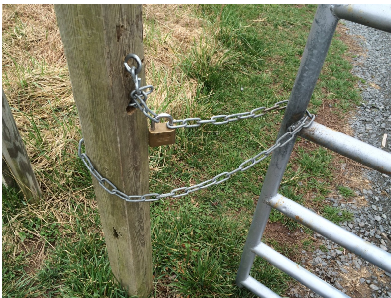
Properly locked gate.

Some modifications have been made by the park staff and we should now be able to securely lock the gate. They have bored a hole thru the post for the chain. Passing the chain thru the post and around the gate defeats entry by prying open the “S” hook, but if the chain is not secured to the post, someone could steal the chain when the gate is unlocked. So, the park people decided to attach the chain to the post with an “S” hook and then thread the chain thru the post before wrapping it around the gate to lock up the park. Please use this method to lock the gate from now on.