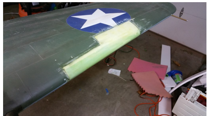
Lots of patch work to wrap up on the P-40

While it will be tough to block off time to get out and fly I do hope to get some building done between diaper changes. To help with that I've picked up a T-38 kit from Wowplanes.com that I'm looking forward to starting on. She'll eventually run on a 90mm Jetfan unit and the kit looks good. It is definitely a builders kit... rough foam blanks, vacuum formed parts, and some nice fiberglass duct work. I've explained to the misses that this is my "Pull" gift... a spin on the new tradition of "push" gifts for new moms. I doubt most expectant mothers would find it funny but my wife just rolled her eyes and reminded me of the other unfinished aircraft in the shop. Before starting on that project I'm focused on putting the big P-40 back together. She will be ready to go in another week or two but will likely wait for Lorton before making another attempt for the skies