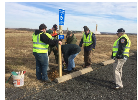
One last thing to do... and we're DONE!