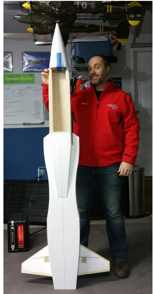
Nice curves on the T-38.

I'd also like to share how excited I am for 2017. You can look for yourself at the Events Calendar on our website... we have a TON going on this year and I expect even more will be added soon. I hope to see everyone at the fields and in the air! Happy Flying in 2017!