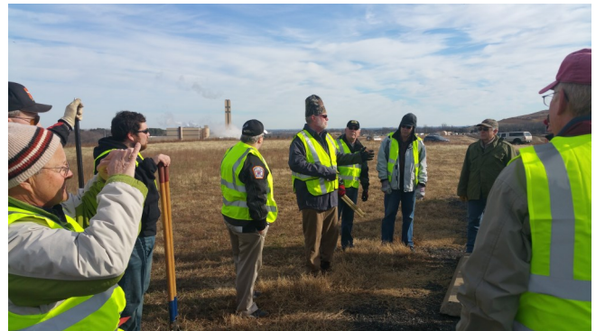
Great turnout for the Lorton Workday

We have had great folks step up over the past year and we can now say we are club well supported by the membership. A great example of this was the turnout for setting up the Lorton field parking lot. There were plenty of folks and lots of enthusiasm.