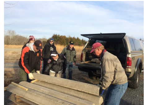
Lorton Work Day volunteers hand at work