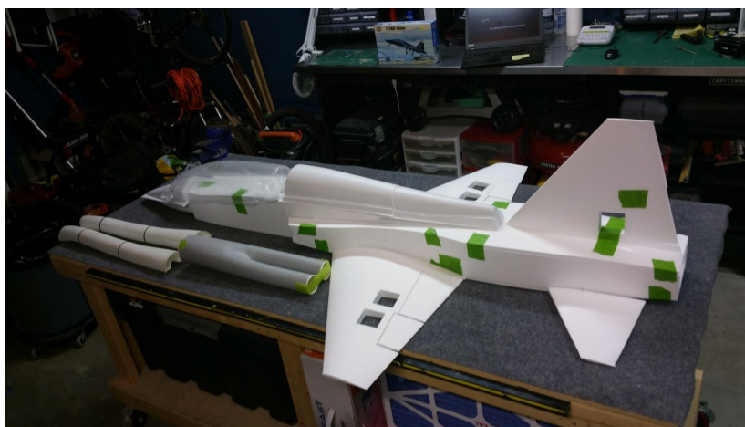
Good looking kit from WOWPLANES. FAR from an ARF but goes together fast!

If you have something you'd like included in the NVRC newsletter please send it to carllydick@hotmail.com