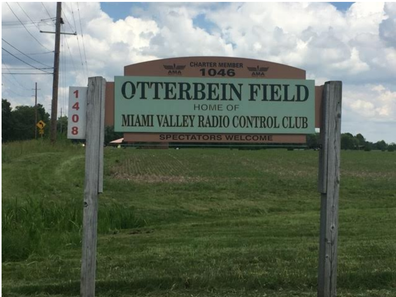
The entrance to the field.